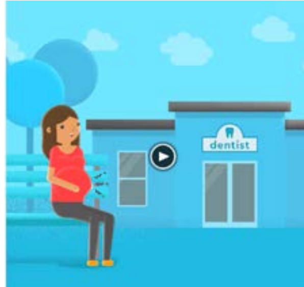
30-sec. video - Why is the Baby Kicking__1080x1080.mp4