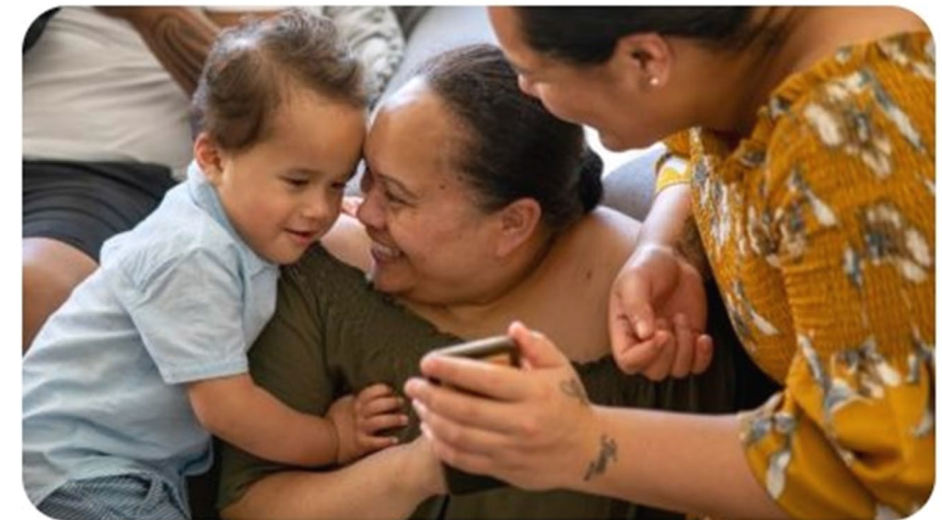
Collaboration leads to better health outcomes for the AAPI community