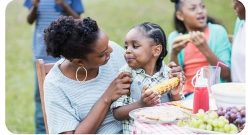
Juneteenth celebrates freedom