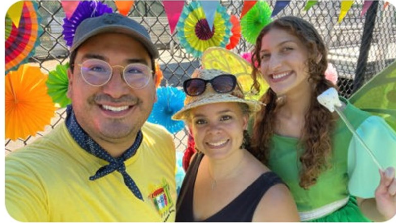
Community expertise guides our engagement strategy