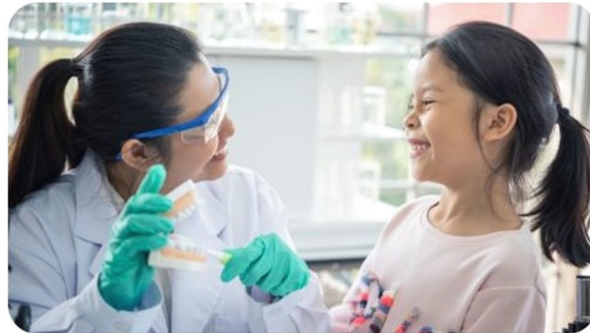
Culturally appropriate care helps expand dental access